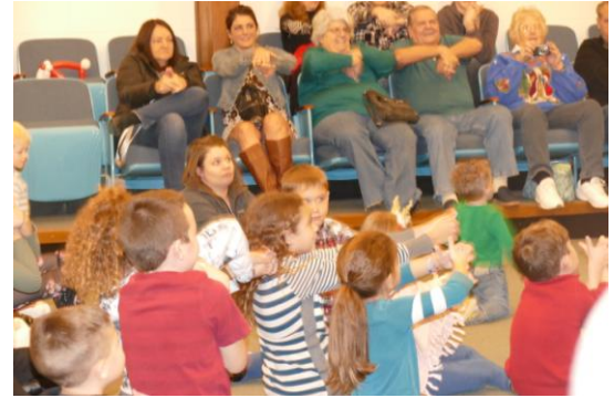
The finale was a visit from Santa.