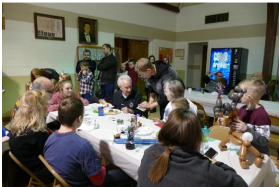
Also, providing entertainment in the lodge room.